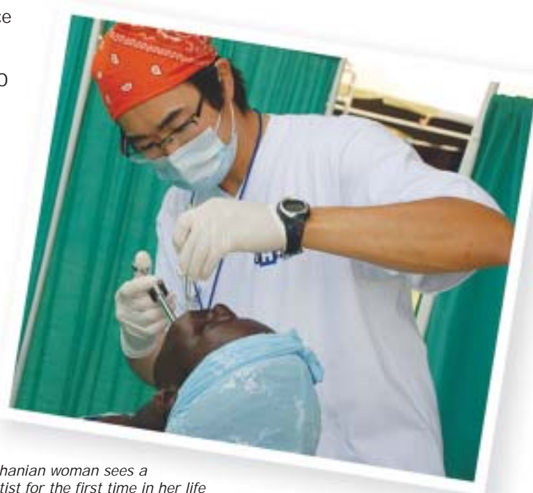
A Ghanaian woman sees a dentist for the first time in her life

“If I go on another dental mission, I will definitely use the Travel Packs again because they are comprehensive, well organized, compact and the value of the supplies provided is incomparable.”