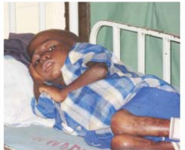
Children were among the most vulnerable who were treated for cholera in Zimbabwe