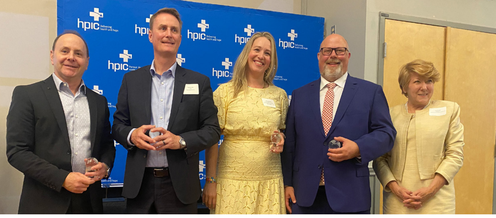
President's Pharmaceutical Circle Award Recipients from Apotext Inc, Pharmascience Inc, Pfizer Canada, and GSK Canada.